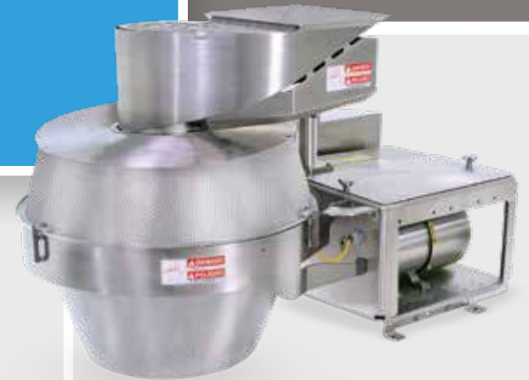
New CCLL Slicer

A new machine joins the legendary Urschel Model CC (Potato Chip Cutter) Series. If you are looking for a standout slicer to add to your lineup, meet Urschel's CCLL (Chip Cutter Large Lattice) Slicer.