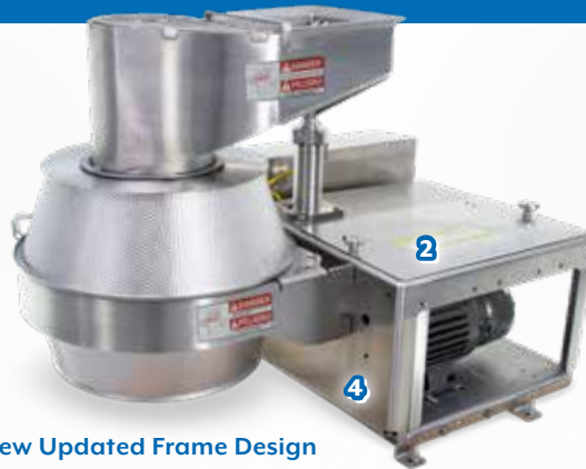
New Updated Frame Design

Urschel introduces a new frame for the CC series (excluding CCX-D). This bold, improved design delivers increased sanitation and flexibility.