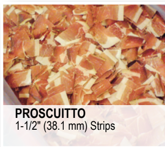
PROSCIUTTO 1-1/2" (38.1 mm) Strips

Other cutting set-ups enable the M6 to produce a variety of dices and shreds. Contact Urschel to learn more.