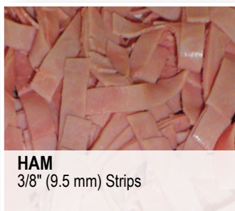
HAM 3/8" (9.5 mm) Strips