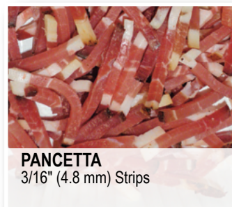
PANCETTA 3/16" (4.8 mm) Strips