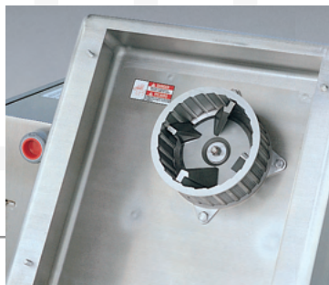
Closer look at the cutting area