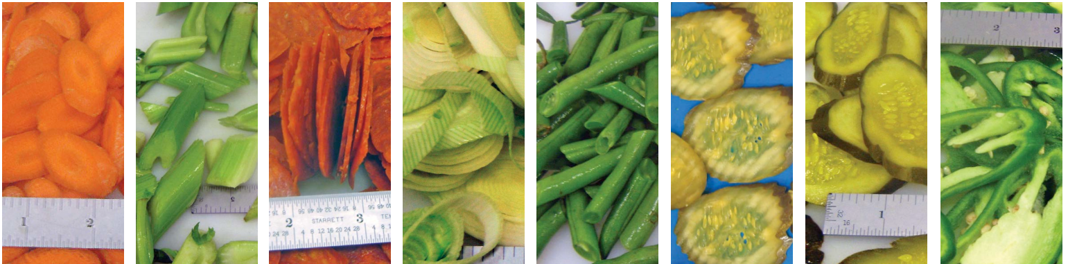
Bias slice thickness and product (left to right): 3/16" (4.8 mm) Carrot, 1" (25.4 mm) Celery, .060" (1.5 mm) Pepperoni, 3/16" (4.8 mm) Leek, 1" (25.4 mm) Green Bean, 3/16" (4.8 mm) Crinkle Pickle, 3/16" (4.8 mm) Pickle, & 3/16" (4.8 mm) Jalapeño

Urschel's reputation as the global leader in food cutting technology is universally recognized. We work with large and not-so-large processors to assist in capturing profitable, niche markets - such as bias slicing.