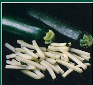
3/16" (4.8 mm) Zucchini (precut to 2" (51 mm) length)