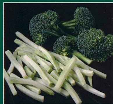
3/16" (4.8 mm) Broccoli Stems (precut to 2" (51 mm) length)