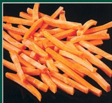
3/16" (4.8 mm) Carrots (precut to 2" (51 mm) length)