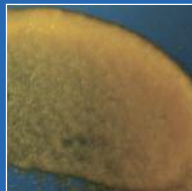
Butternut Squash 212084-1° Microcut Head