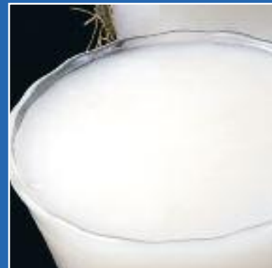
Coconut Cream 216084 Microcut Head