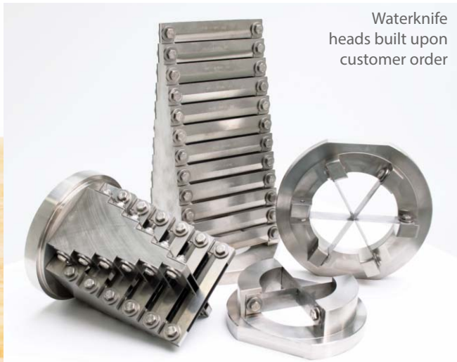
Waterknife heads built upon customer order

certification and verification before any other processes commence. The coil is then put through a number of conditioning steps before the actual knife making begins.