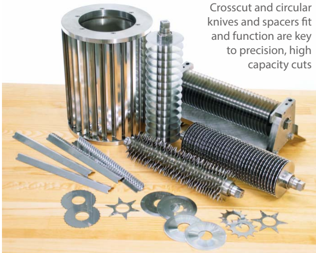
Crosscut and circular knives and spacers fit and function are key to precision, high capacity cuts