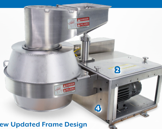
New Updated Frame Design

Urschel introduces a new frame for the CC series (excluding CCX-D). This bold, improved design delivers increased sanitation and flexibility.