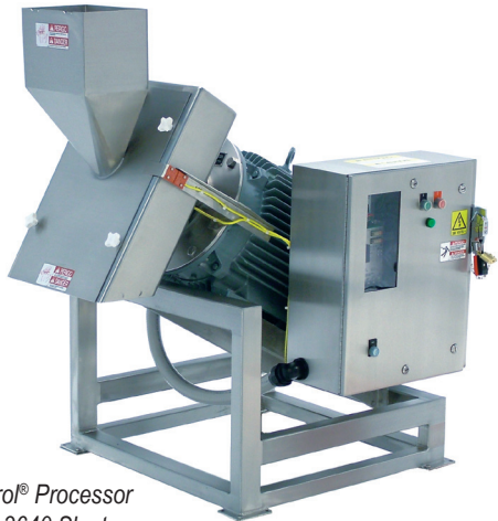
Comitrol® Processor Model 3640 Slant