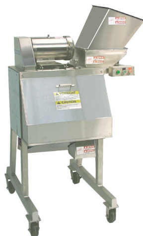
Model RA-D with optional stainless steel motor and castor frame.

STRIP CUTS: Removal of crosscut knife spindle and shaft will enable the user of the RA-D to produce strips of different lengths as determined by incoming product size. A circular spindle change may also be required.