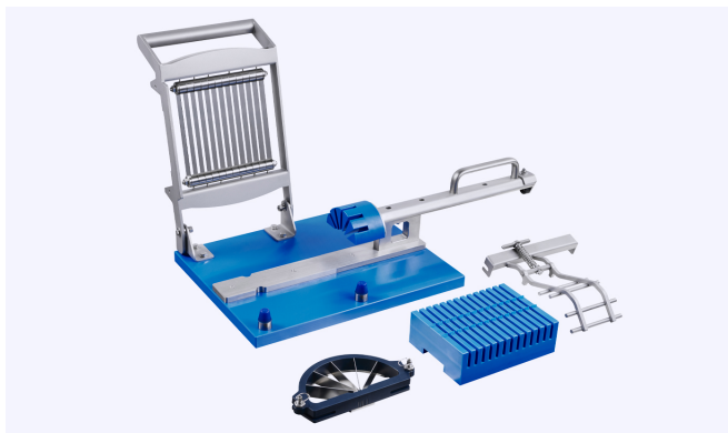
Illustration only, subject to technical changes.

The MMC 150 is the ideal addition to the MPC 100 manual pineapple chunk cutter for fruit processors.