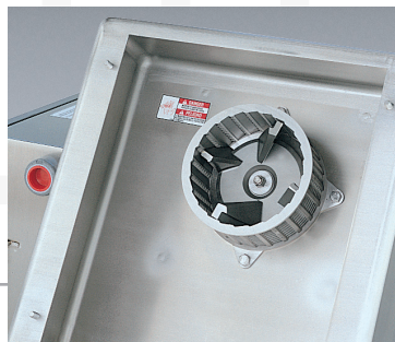
Closer look at the cutting area